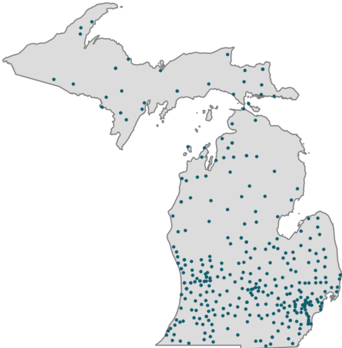
Figure 2. 2020-21 Michigan Virtual ISD, LEA, PSA District and Nonpublic Schools with Student Enrollments